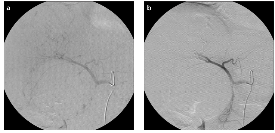
Figure 2. a, b. Selective angiography of the celiac trunk before intra-arterial embolization (a) demonstrates the feeders of the hemangioma. Panel (b) shows successful occlusion of the feeders.

(PSIAE group, n=11) or without preoperative embolization (non-PSIAE group, n=11). The selection of patients for PSI-AE depended on the location of hemangioma and expected operative difficulty. Centrally located liver hemangiomas, hemangiomas located close to the hepato-caval junction, hemangiomas located in caudate lobe and hemangiomas closely related with hepatic veins or portal structures are associated with significant bleeding risk and operative difficulty. The procedure related risks were shared with patients, informed consent